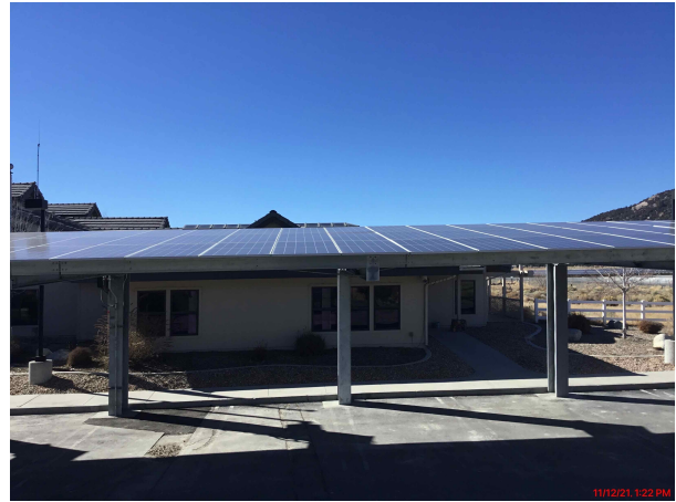
As Contracted Energy Last Month (kWh)