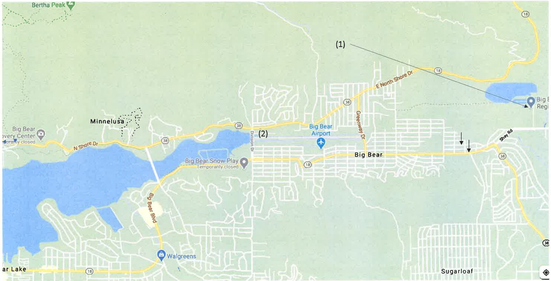
Return Activated Sludge Header Replacement Project Location Map (1)